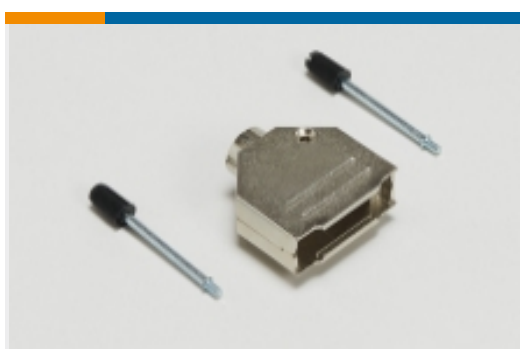
D-Sub Backshells & Clamps(135)